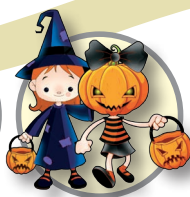
trick or treat